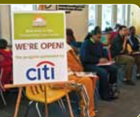
Tax Center at Goodwill

This year saw hundreds of changes in tax law for working poor families with the federal stimulus bill. Our staff is reviewing the changes and expects to help explain what the stimulus bill really means for low-income families through community education and outreach in the coming months.