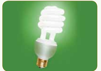
Top: Solar power vents Middle: Solar screens Bottom: CFL bulb