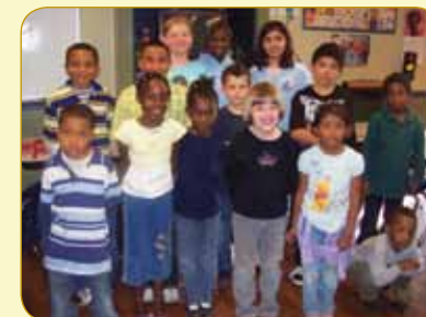
Sleepy Hollow's after-school students.

In February, kids from the after-school program at Sleepy Hollow Apartments in Arlington wrote letters to President Obama. They shared their opinions about what he should accomplish in office and were recently delighted to receive a response and photo from the President.