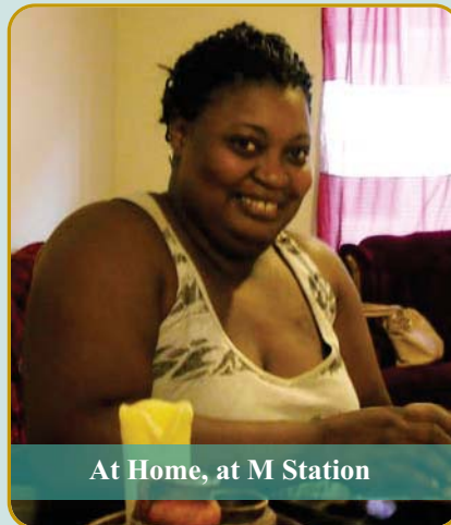
At Home, at M Station